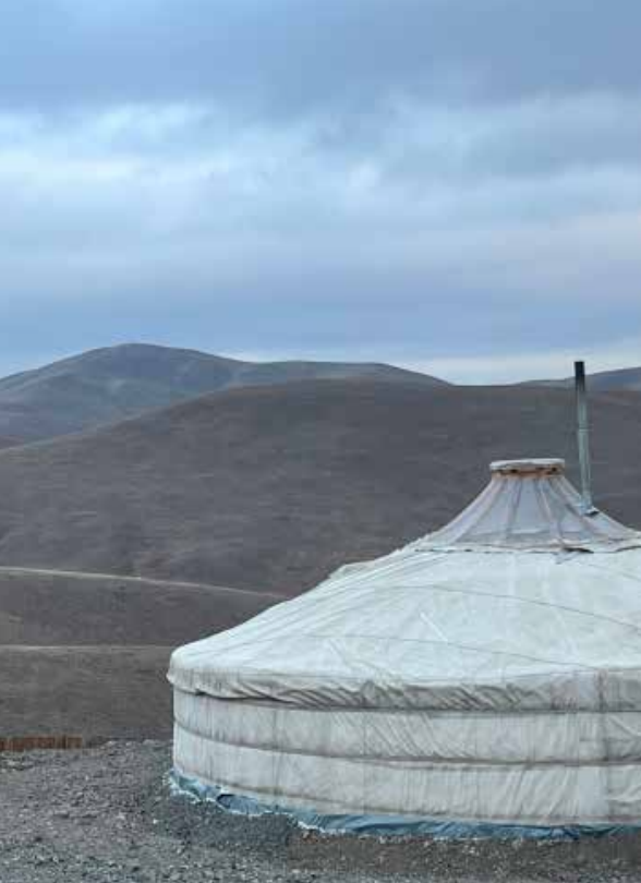
A new church in Mongolia meets in a yurt. Story on page 7.